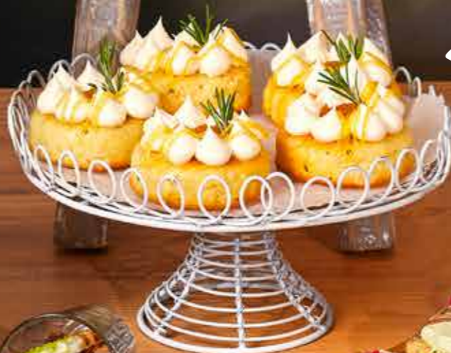
PISTACHIO FUSION Recipe see page 21