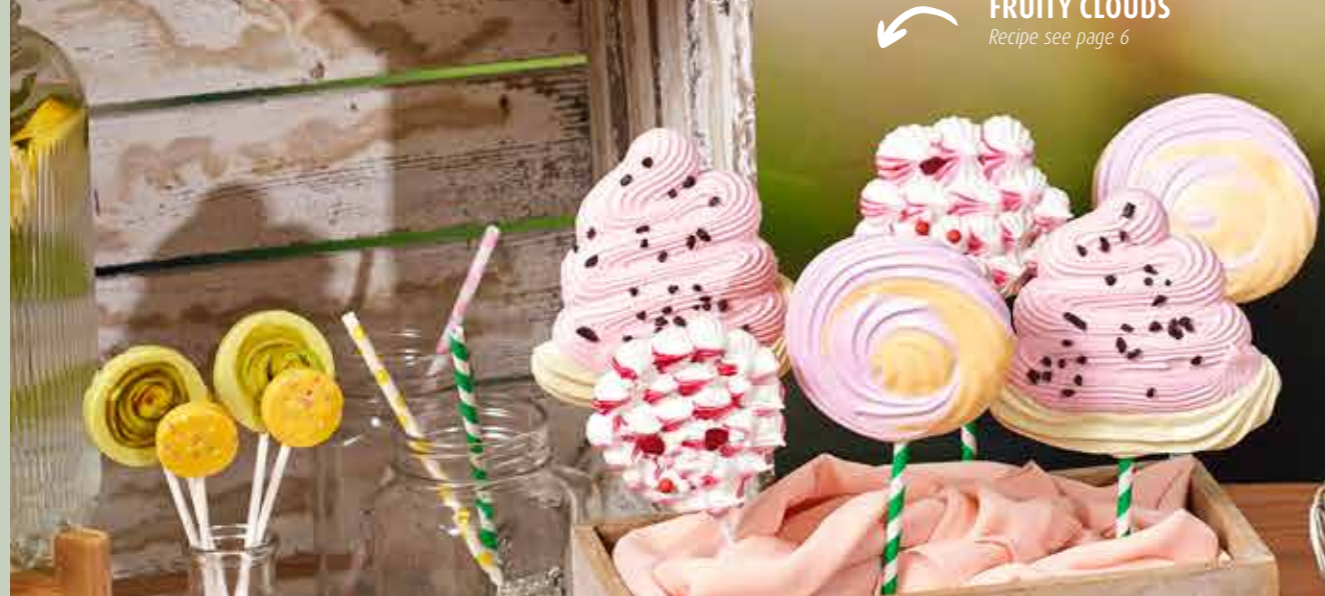
FRUITY CLOUDS Recipe see page 6