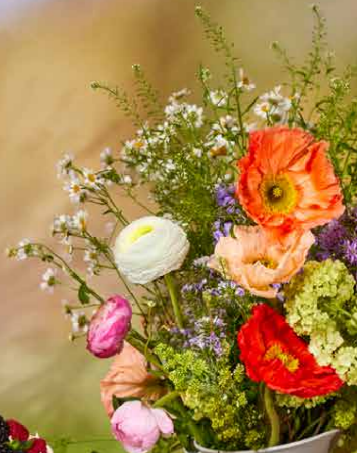
FLUFFY GOOSEBERRY Recipe see page 16