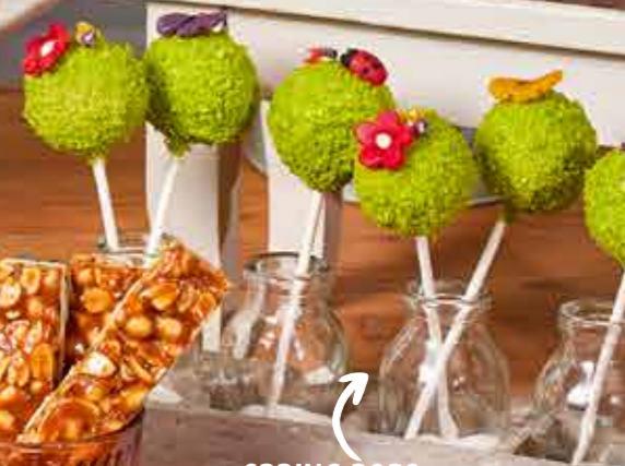
SPRING POPS Recipe see page 19