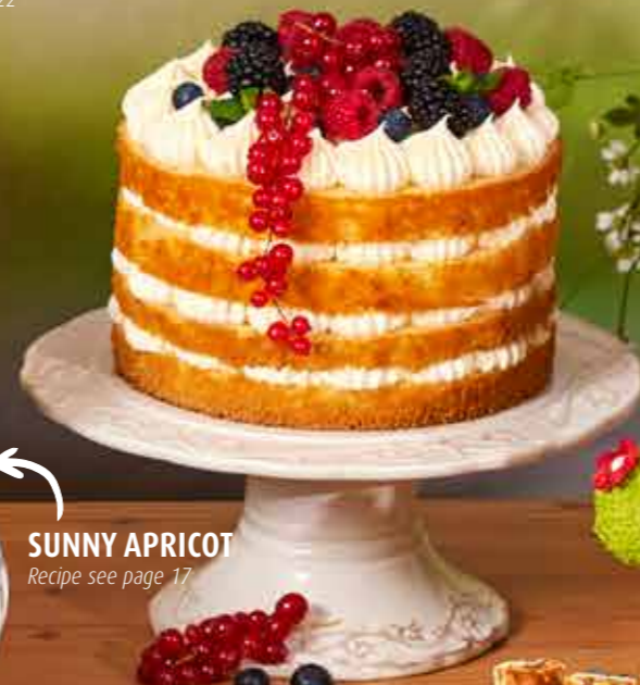
SUNNY APRICOT Recipe see page 17