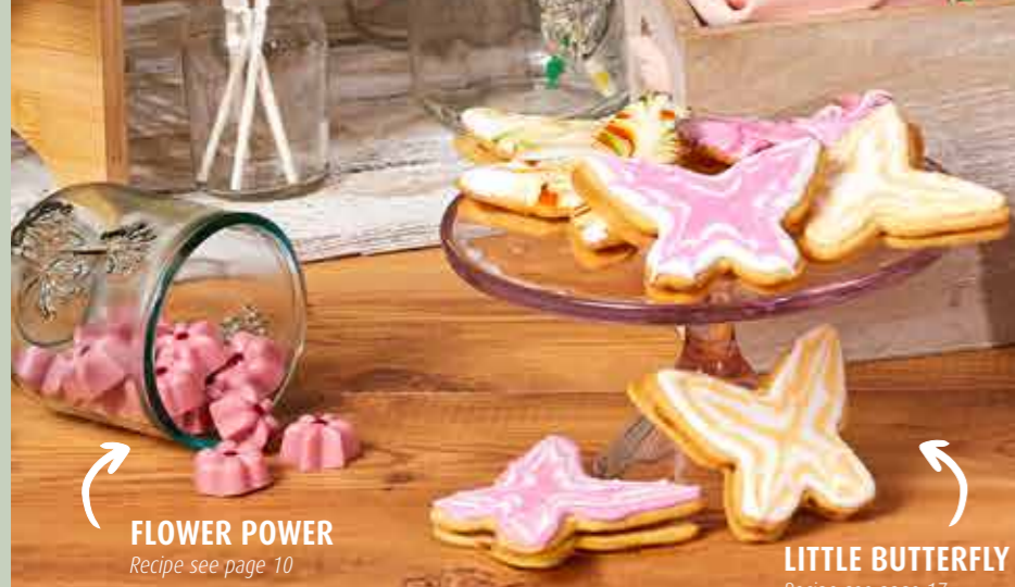
FLOWER POWER Recipe see page 10