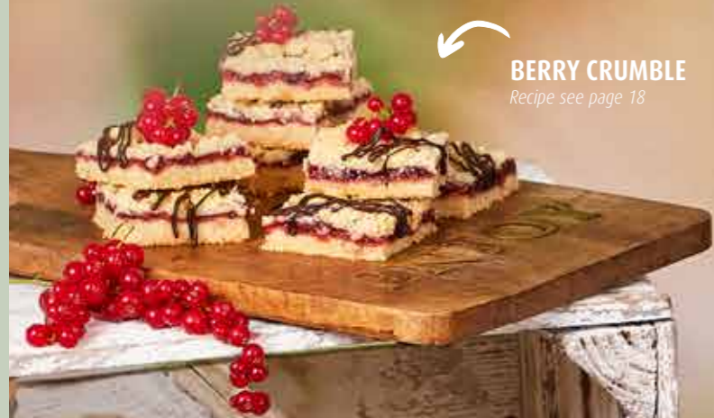
BERRY CRUMBLE Recipe see page 18

Rustic, charming, and inviting - this Sweet Table brings true garden party vibes! Colourful blossoms, fresh berries, and handmade treats create a relaxed atmosphere and moments of pure indulgence under the open sky.