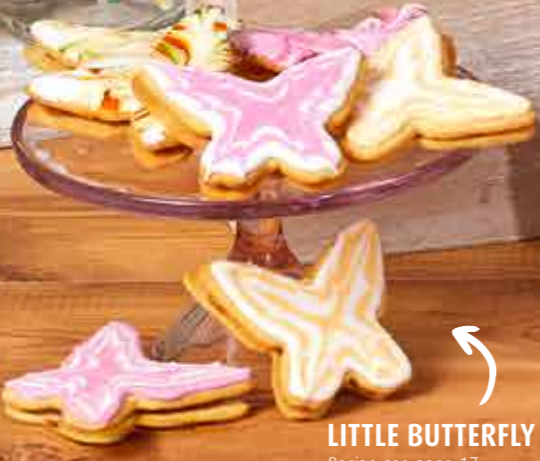
LITTLE BUTTERFLY Recipe see page 17