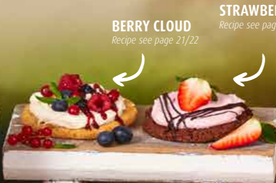
BERRY CLOUD Recipe see page 21/22