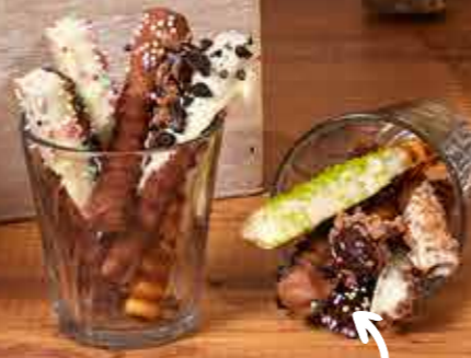
WAFFLE STICKS Recipe see page 12